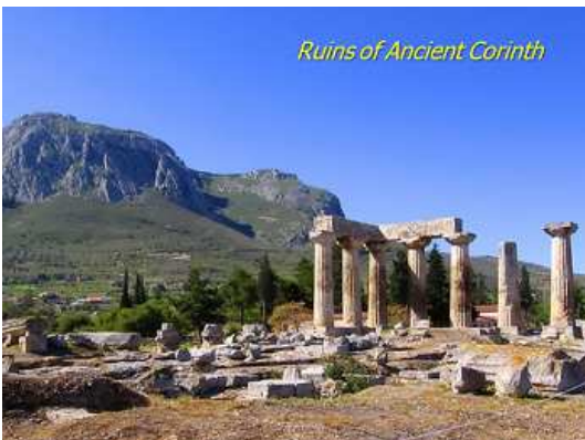
Ruins of Ancient Corinth

In the Law it is written: “Through men of strange tongues and through the lips of foreigners I will speak to this people, but even then they will not listen to me,” says the Lord.